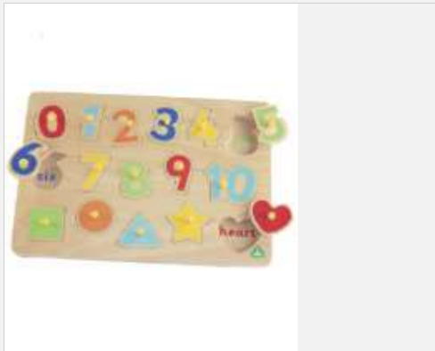
C1 Rght shelf 1