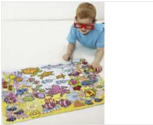
C1 Right floor level