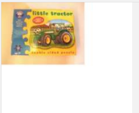
C1 Right floor level