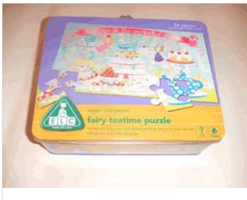
C1 Left shelf 2